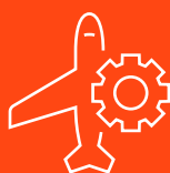
FIELD SUPPORT SERVICES